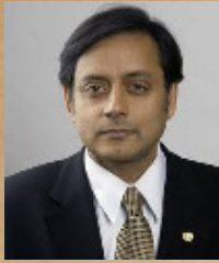
Dr. Shashi Tharoor Minister of State Ministry of Human Resource Development