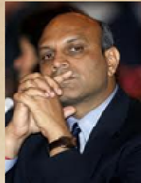
Dr. Pallam Raju Union Minister for Human Resource Development Government of India