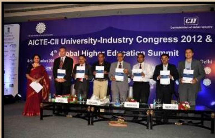
Release of report on Annual Status of Higher Education of States & Union Territories (ASHE 2012)