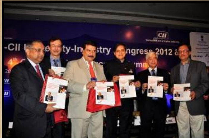
Release of Report on AICTE-CII Survey of Industry-Linked Technical Institutes 2012