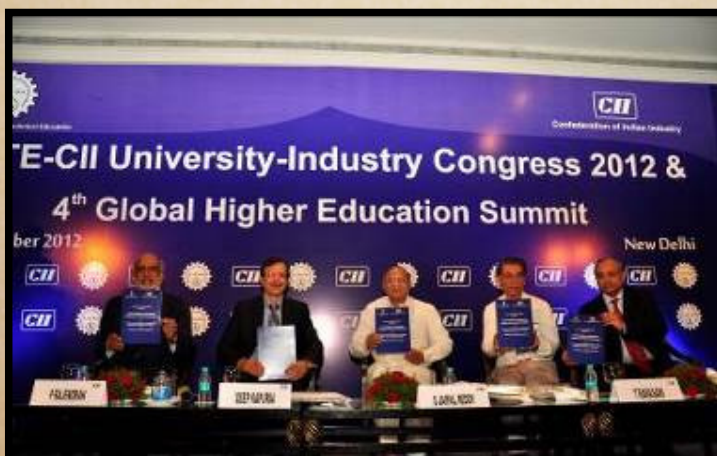
Launch of Prime Ministers Fellowship Scheme for Doctoral Research